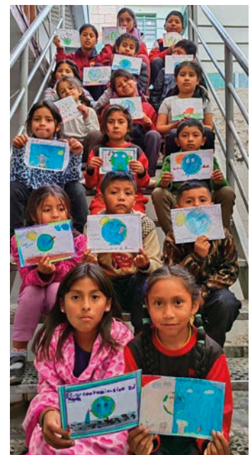
Children in Cusco, Perú drew their demands and the impact of climate change on their lives.