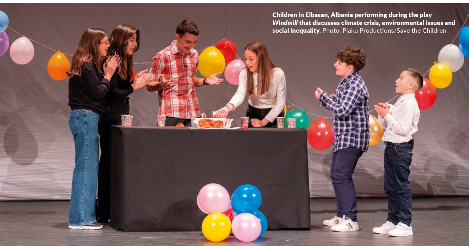
Children in Elbasan, Albania performing during the play Windmill that discusses climate crisis, environmental issues and social inequality.