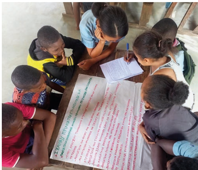
Boys and girls in Madagascar writing letters for Generation Hope campaign.