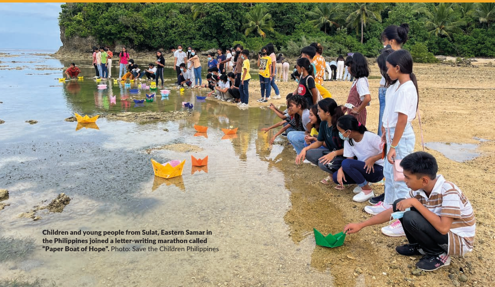
Children and young people from Sulat, Eastern Samar in the Philippines joined a letter-writing marathon called “Paper Boat of Hope”.