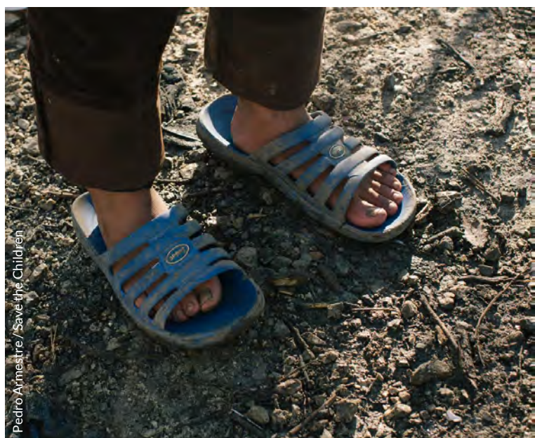
Pedro Armentre / Save the Children

In practice, this was already the case, with reports of people seeking international protection being sent back to Belarus, 51 in what constitutes "mass and illegal expulsions of people rounded up in the forests", including at least 100 children, according to Polish civil society organisations. 52 There are also credible reports of Polish border guards separating families when some family members required hospitalisation, prior to expelling the others across the border back to Belarus, including one case of a woman being separated from her five-year-old son. 53 The state of emergency declared on 2 September 2021 prohibited access to the border for journalists, monitors, and civil society organisations and aid groups seeking to provide assistance to arriving refugees. 54