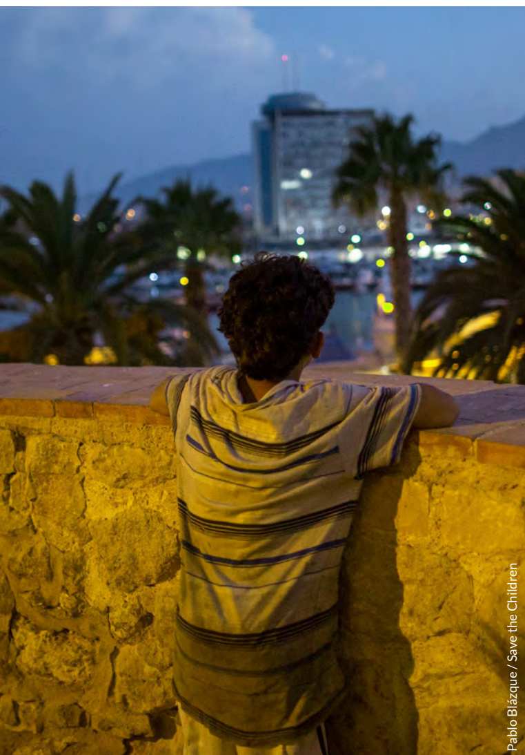
Pablo Blázquez / Save the Children

There are discrepancies at national level too. In Sweden and Finland, for example, Ukrainians offered protection under the TPD are not submitted to the popular register in the same way as other persons granted residence permits, and are therefore not granted all social and economic rights new arrivals normally are. In Sweden, those who have fled Ukraine are only entitled to emergency healthcare and receive a very limited daily financial allowance at the same level as asylum-seekers, which is considerably lower than the support provided to recognised refugees. 118