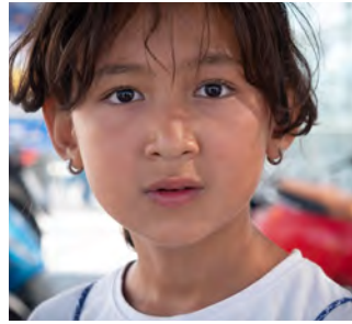
Pedro Armestre / Save the Children